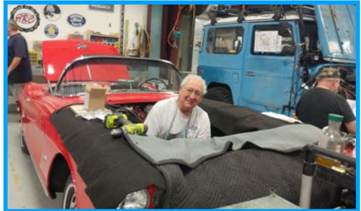
Ed's Flintstone Mobile