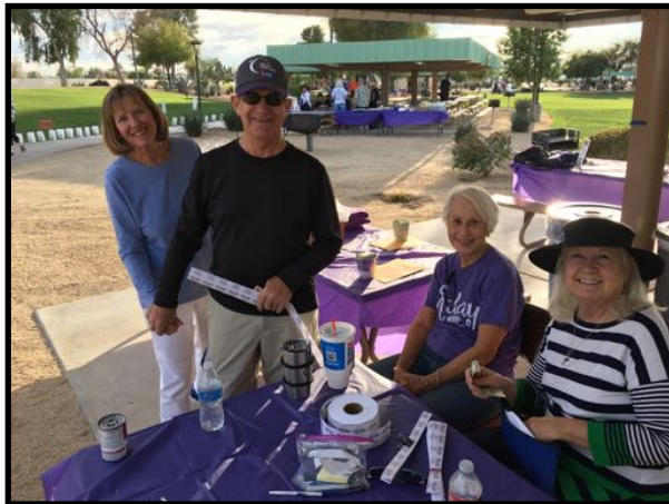
Raffle tickets were sold