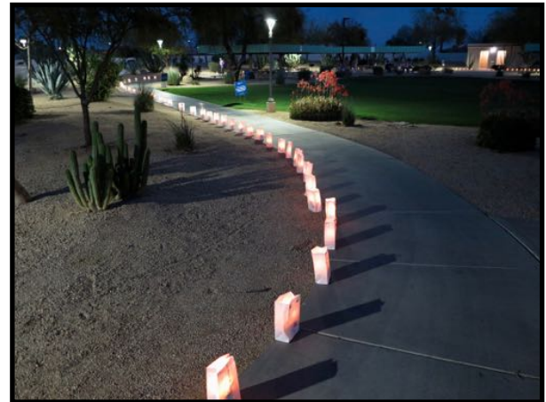
Memorial luminaries lit the walkway