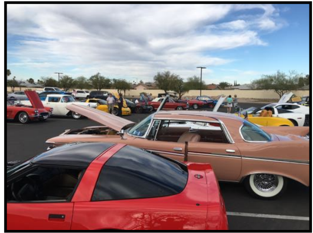
Car Show from 3:00 to 5:00 PM