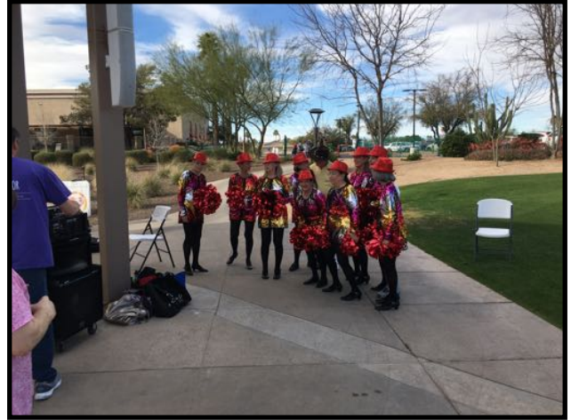
Jazzy Poms performed