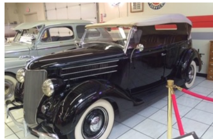
ARC's 1936 Ford Phaeton