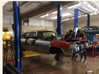
Dysart High School's 1967 Cougar